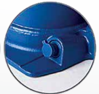
Inside Safety Valve